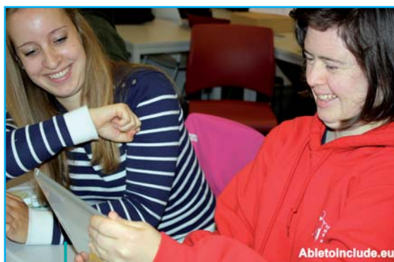
Participants in the Thomas More focus groups learned how to use tablets and social media applications.

SafeSurfing will help people with disabilities use the Internet in a safer way.