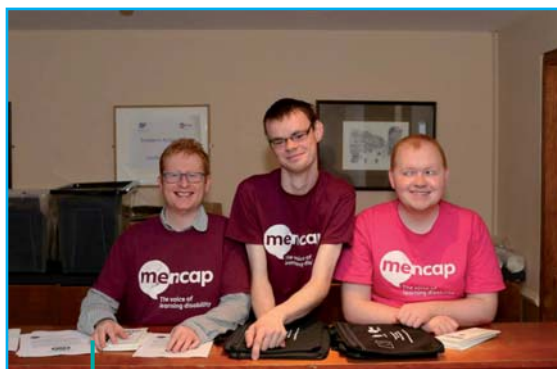
Europe in Action participants were welcomed by Inclusion Europe and Mencap staff members and volunteers.

To help schools and services better listen to children with disabilities we published different tools, like booklets and reports.