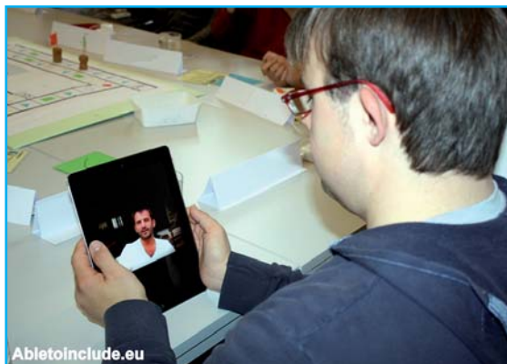
Some participants even Skyped with one another.

Many of the Able to Include focus groups revealed that people with intellectual disabilities, and particularly their carers, are concerned about the risks associated with surfing the Web. Inclusion Europe's SafeSurfing Project will address just that. As data protection was deemed as a fundamental right in Europe, Inclusion Europe will train people with intellectual disabilities on how to keep their personal information safe when using the Internet. The project was selected by the European