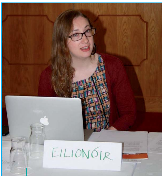
Experts discussed alternatives to guardianship regimes for people with intellectual disabilities.

Inclusion Europe's new project, called TOPSIDE+ will train people with intellectual disabilities to become peer-supporters.