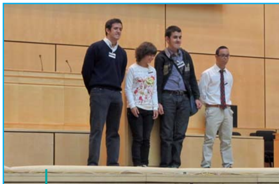
Our four young self-advocates at the United Nations headquarters in Geneva.

To inspire and motivate organisations working for and with children with disabilities, partners in the Hear our Voices Project also published several tools, including a handbook describing participatory mechanisms in schools and child care services, and a good practice booklet. The Project advocated for age-appropriate and accessible information to be available for children with intellectual disabilities, which could be achieved by using alternative communication methods, person-centred methods and direct consultation with children, their families or close ones. For more information on the Hear our Voices Project, please check: http://www.childrights4all.eu/